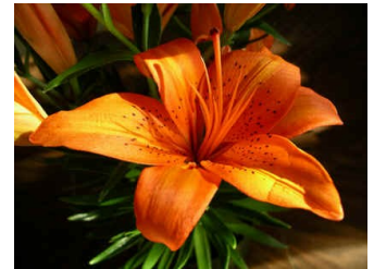
The symbolism of the tiger lily is like other lilies in that they symbolize the feminine principle reflecting the qualities of mercy, compassion, kindness and unconditional love.